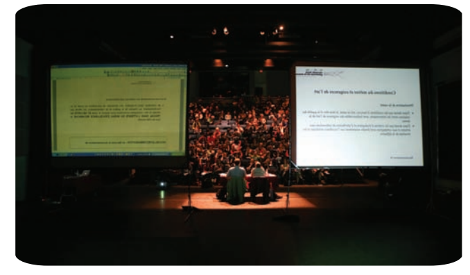
··· Plenary session at l'Agora de la danse

There's so much to do and even though the RQD can't do everything, it's often the only organization that can tackle most of the issues. I'm reminded of the time when choreographers were asked to join the Union des artistes after the latter submitted an application for recognition to the Commission de reconnaissance des associations d'artistes et des associations de producteurs (CRAAAP) in July 2008. The choreographers asked the RQD to act on their behalf in order to have original creations and repertoire dance excluded from the UDA's jurisdiction. After a difficult and costly legal battle, at the same time as the L'Allier commission was under way, it became clear that the professionalization of work relations