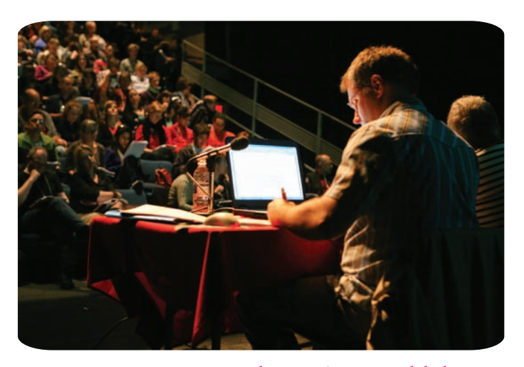
..... Plenary session at Agora de la danse