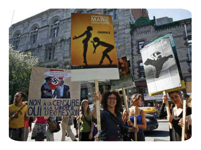
..... Demonstration against cuts to arts funding (August 2008)