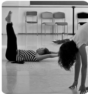
RQD technical class