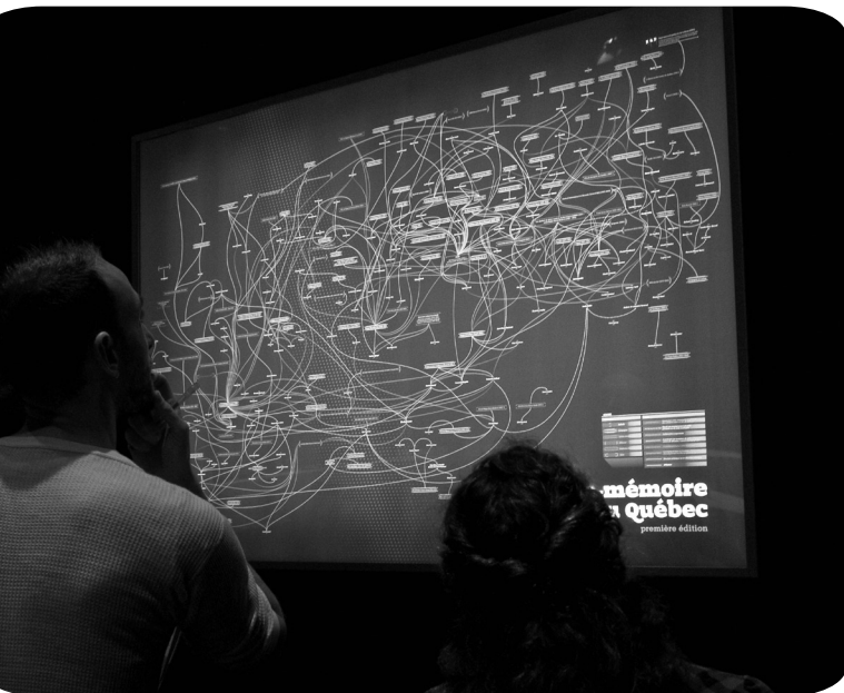
..... The “memory web” of dance in Québec