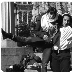
Pas de danse, pas de vie! (2010)