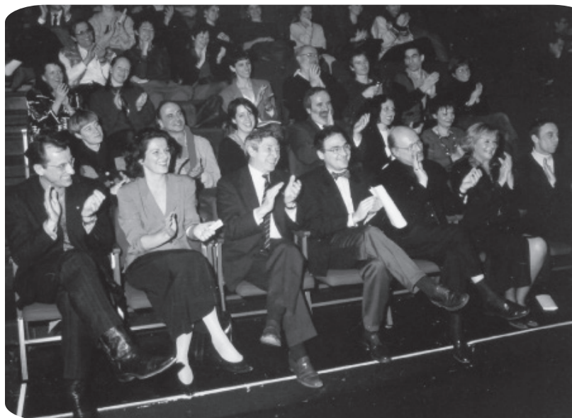
..... First États généraux de la danse