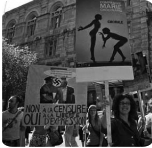
Demonstration against cuts to arts funding (August 2008)